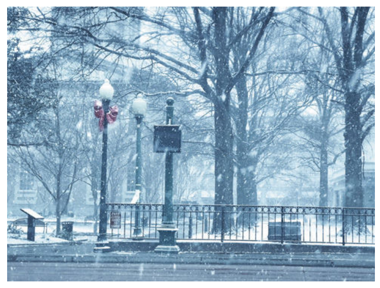
Snow outside the MacArthur Memorial in Norfolk

February is the shortest month of the year. The Romans are blamed for removing days. January and February were the last two months to be added to the Roman 12-month calendar. Originally, winter was devoid of months. February ended up representing the