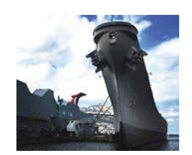
The USS Wisconsin at the Nauticus Museum on Norfolk's waterfront