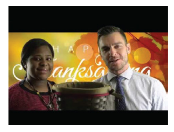
Click here to play the video

Being a winner allowed some of our entrants who would not otherwise have afforded a turkey and the trimmings to have a great Thanksgiving.