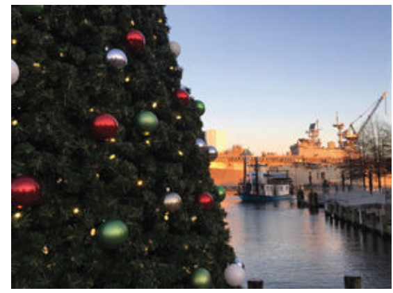
Christmas in Portsmouth

December was also a time when wine and beer was fermented and became ready for drinking.