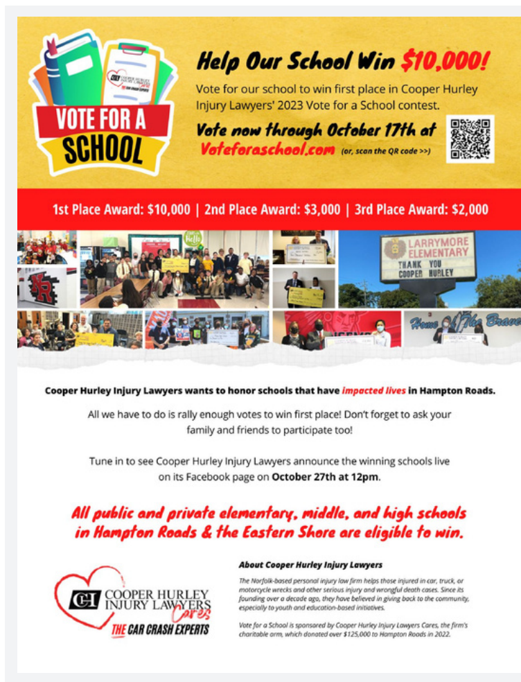
Download 8.5x11 Flyer