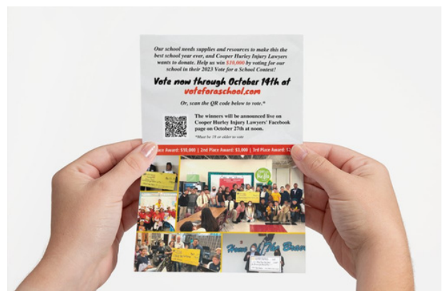
Download 5x7 Folded Card