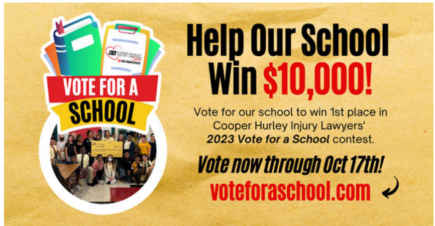
Download Facebook Flyer