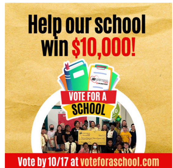
Download IG Flyer